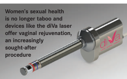
Women's sexual health is no longer taboo and devices like the diVa laser offer vaginal rejuvenation, an increasingly sought-after procedure

Vaginal health is another hot topic in the realm of medical aesthetics, with a wide range of energy-based systems focused on women's key concerns, including vaginal dryness, pain during intercourse, laxity and stress urinary incontinence, most often brought on by childbirth and menopause. There is an unmet need for topical agents to complement these treatments, the most common being performed with CO 2 , radiofrequency and Erbium:Yag wavelengths. Treatments for external, as well as internal improvements are now