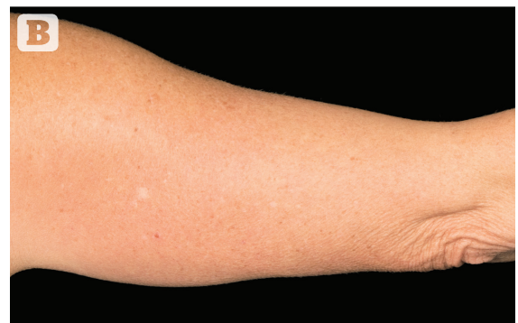
CoolSculpting sessions (A) before (B) 12 weeks after.