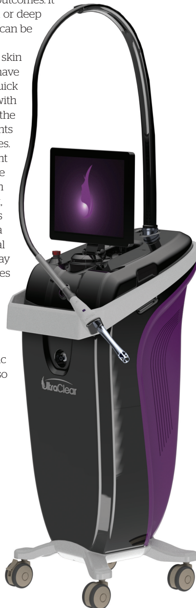
Brian S. Biesman, M.D., F.A.C.S. UltraClear™

“Full face treatment takes less than ten minutes. Deeper, more aggressive treatments take a bit longer but are still easily performed in the office.”